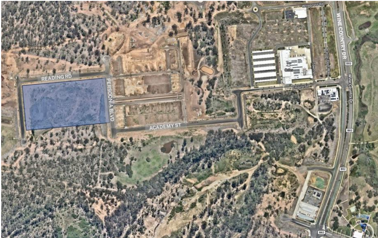
Figure 1: Location of the land (3-hectares) already acquired for the new schools.