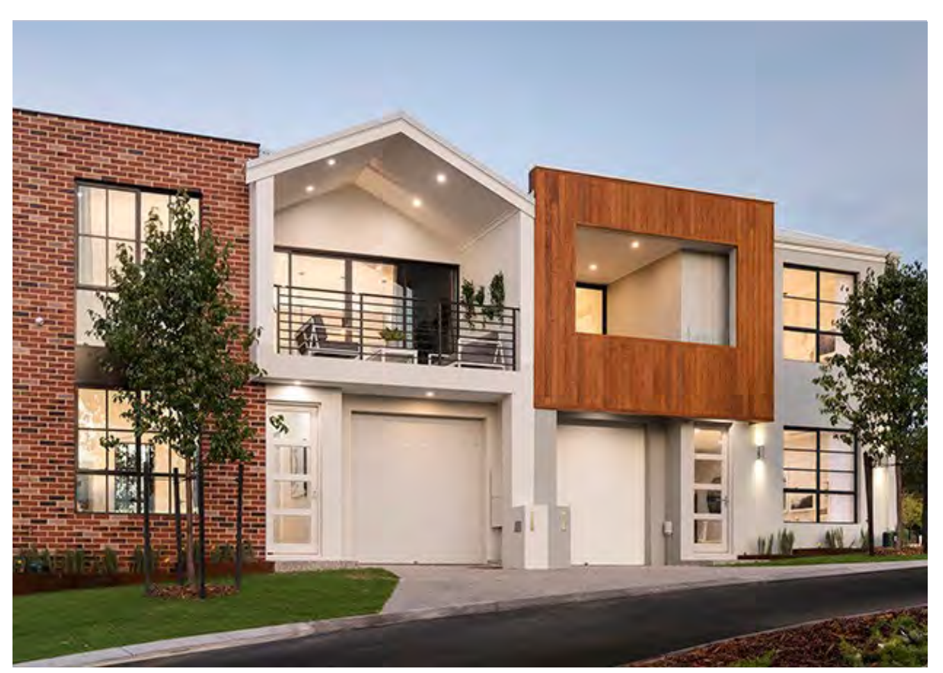
Increased ground floor ceiling heights create a vertical built form emphasis. This contributes to the urban character of the Huntlee Town Centre.