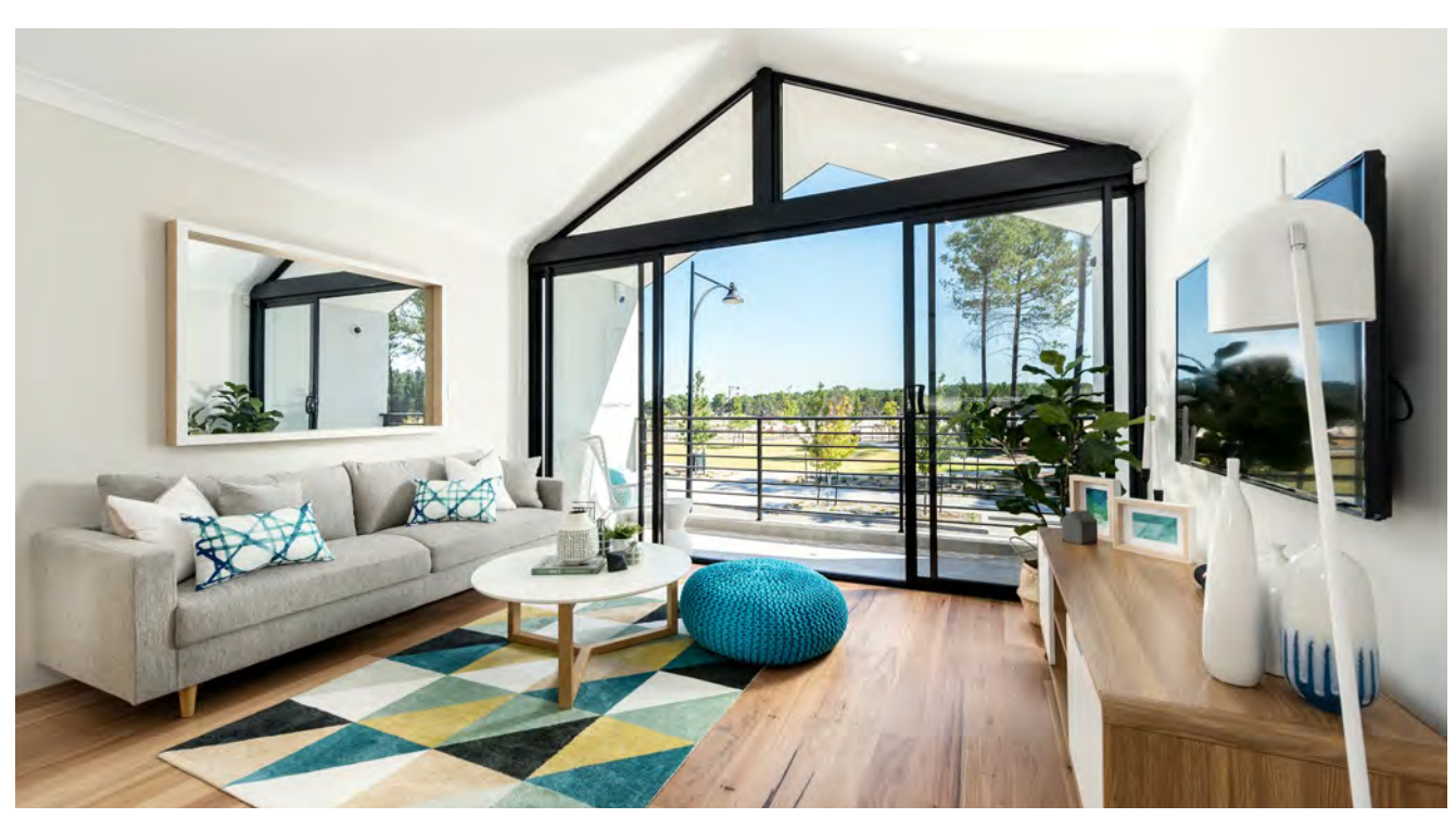
Upper living area and private balcony overlooking the street