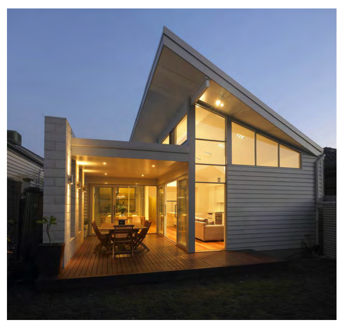
Skillion roof and extended north facing windows improve passive heating during cooler months.

Research suggests that a light-coloured roof could reduce a home's internal temperature by 4C on average and up to 10C during a heatwave. Light-coloured roofs also reduce the urban heat island effect – the ambient street temperature within a neigbourhood.