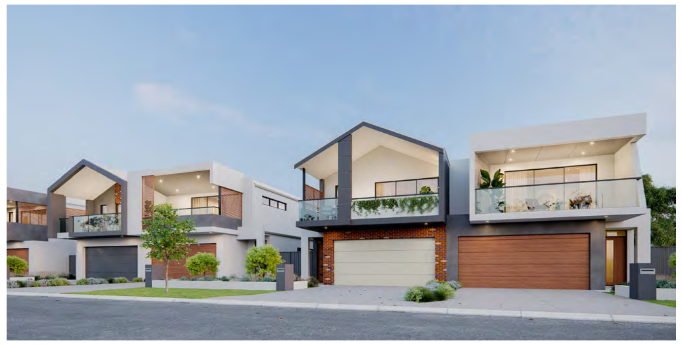
Elevations are comprised of a mix of materials, colours. The visual dominance of garages is reduced by projecting upper levels forward of the garage.