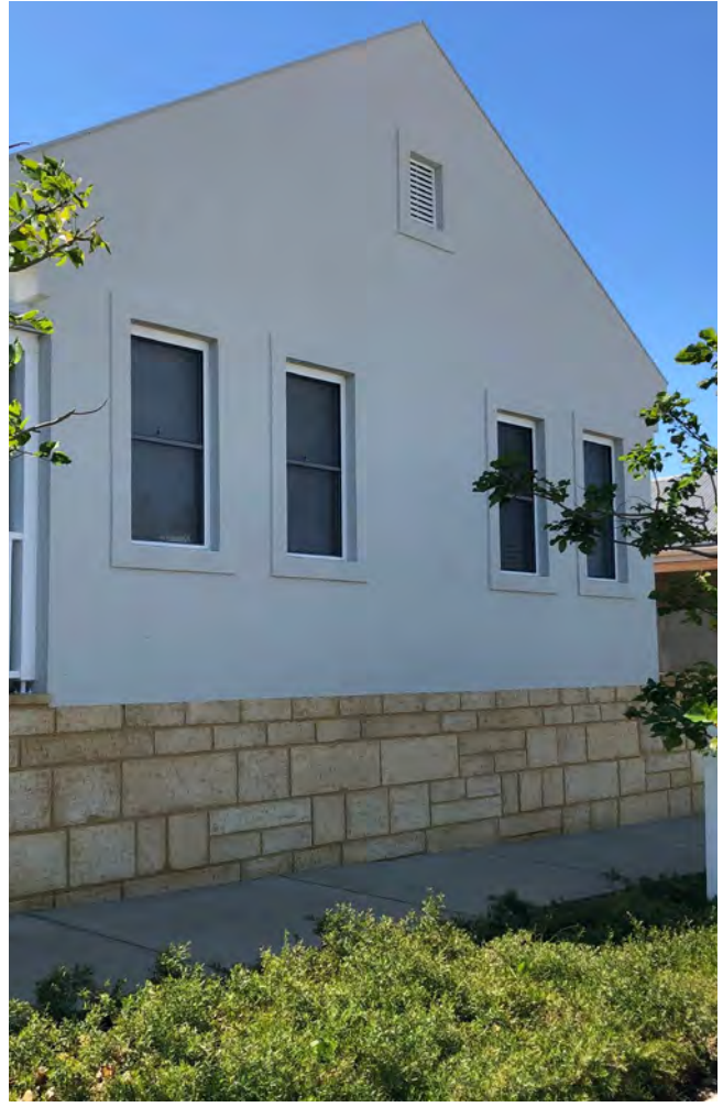
A gable roof end can be used as a design feature to create a more urban dwelling aesthetic.

The roof design will create the dwelling outline as it is viewed from the street and provide shade to the dwelling. Roof forms must be simple – pitched/gable, skillion or flat.