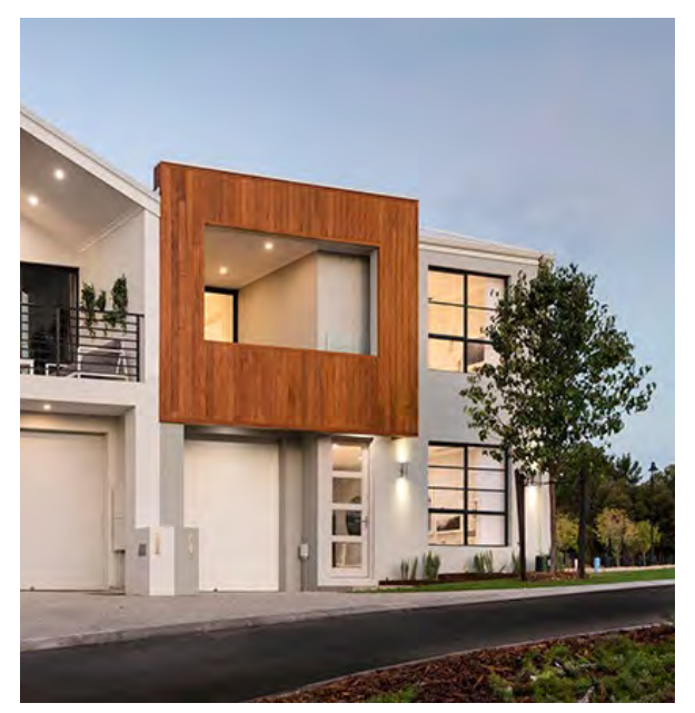
Visually appealing streetscapes are comprised of considered elevation designs, front garden landscaping and street trees.

LWP's aim is to create visually appealing streets with diverse housing forms and active street frontages with good connections between homes and the public domain. Careful placement of windows and doors should consider internal layouts of rooms and external appearances of dwellings. Window shading from eaves overhangs, hoods, canopies and other shading devices will enable unique dwelling designs and control of solar gain.