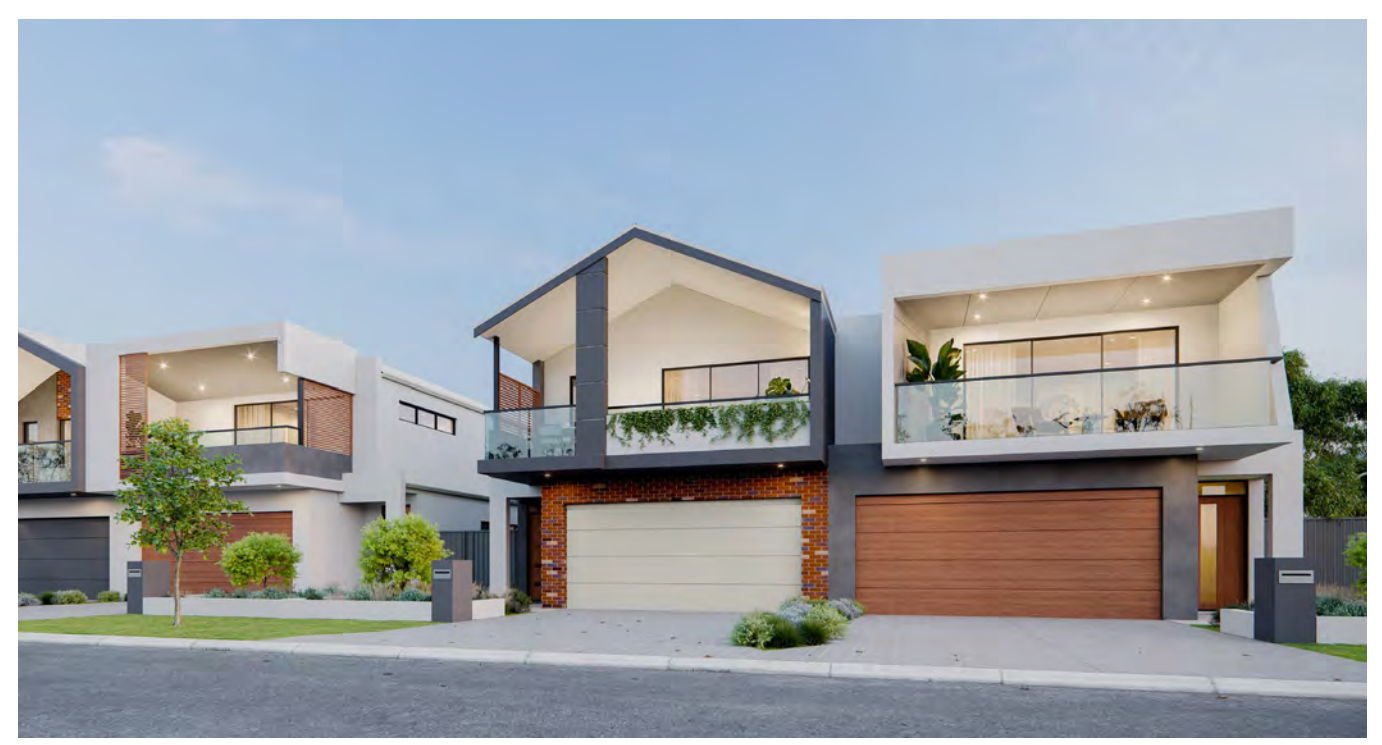
A mix of simple roof forms (pitched/ gable, skillion or flat) create a visually harmonious and interesting streetscape.