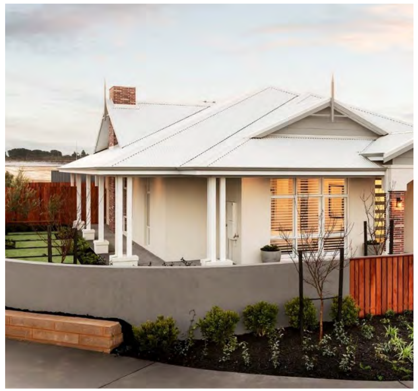
Extending a verandah along the secondary elevation improves the visual presentation of a dwelling at a street corner.