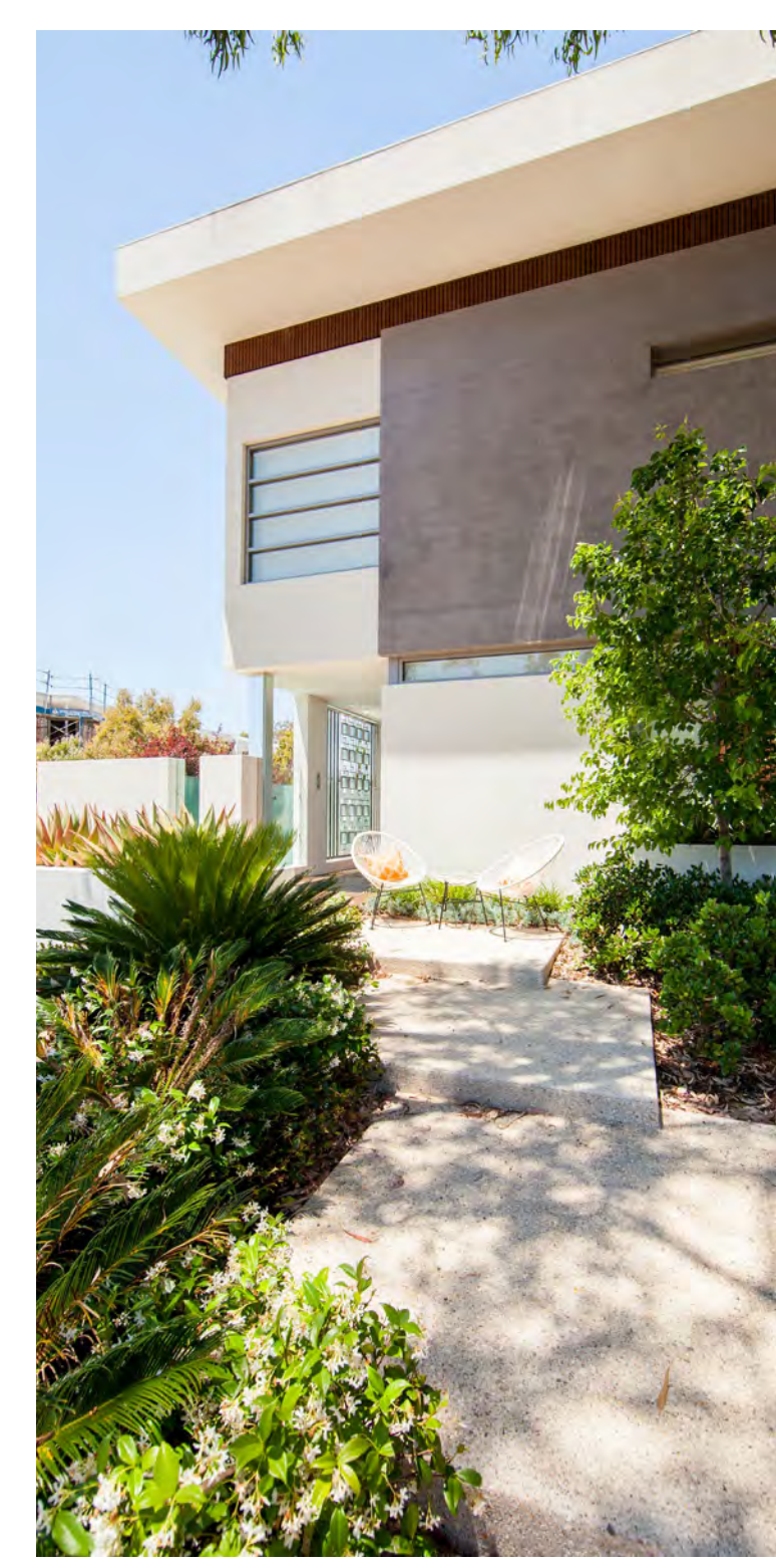
Front landscaping can enhance the appearance of a dwelling.

Landscaping will only be installed once the driveway and crossover are completed and all excess soil and debris is removed from the site and the lot is restored to the as constructed level prior to building commencement.