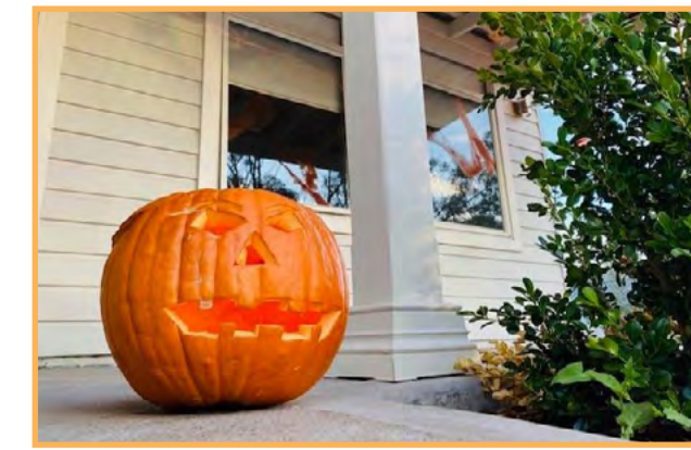
Looks good enough to eat... your visitors!