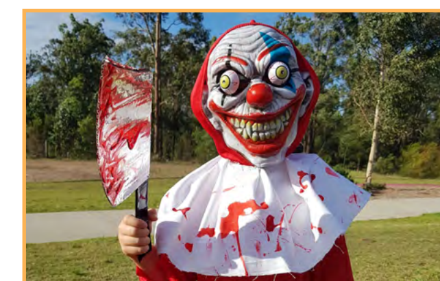
Nope. No. Nah. Please go away now!