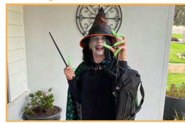
Full commitment, we can imagine that witchy cackle!