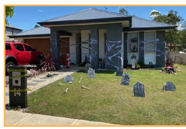
Ugh, the tombstones and the lawnmower of horror!