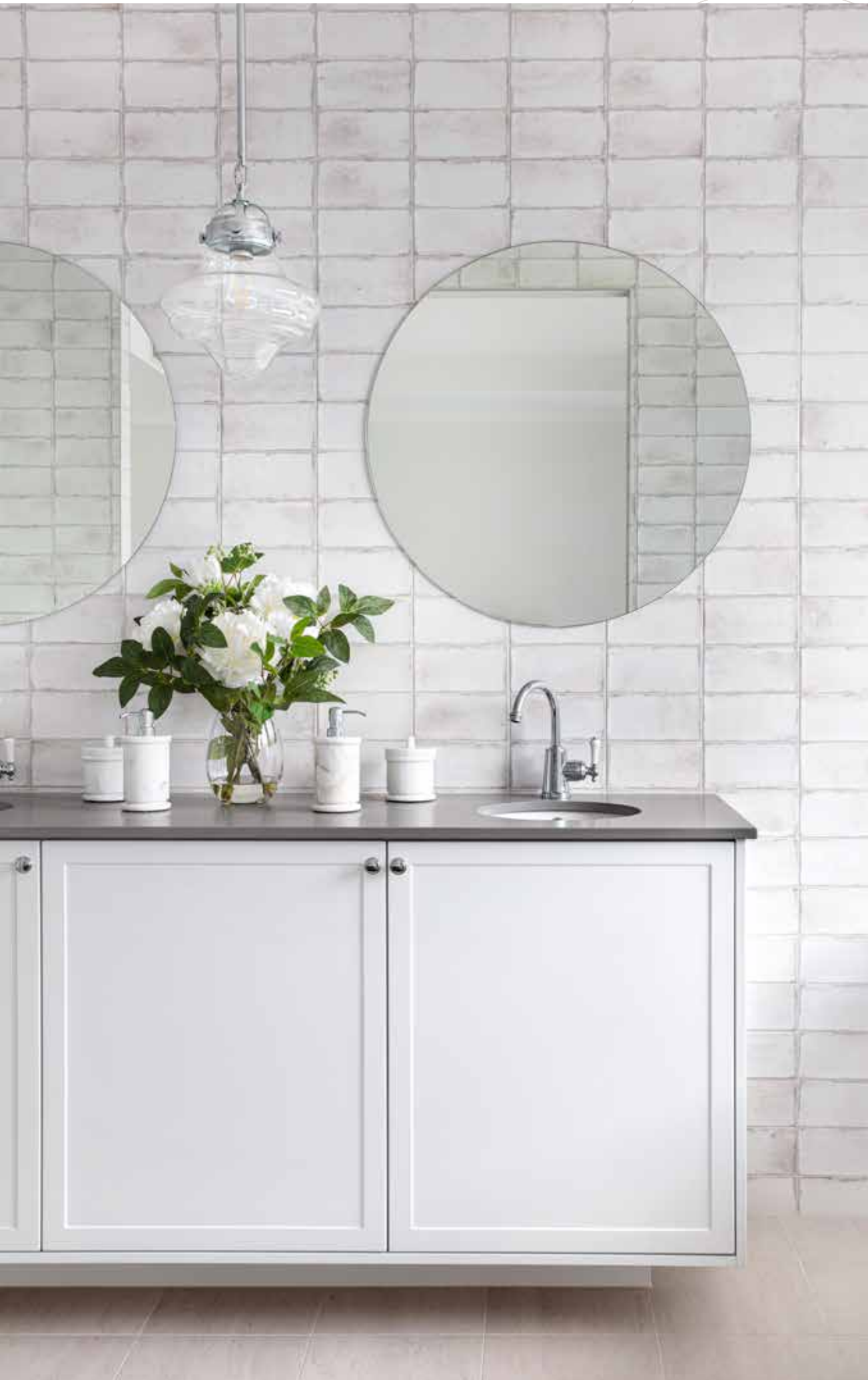
On display at Huntlee