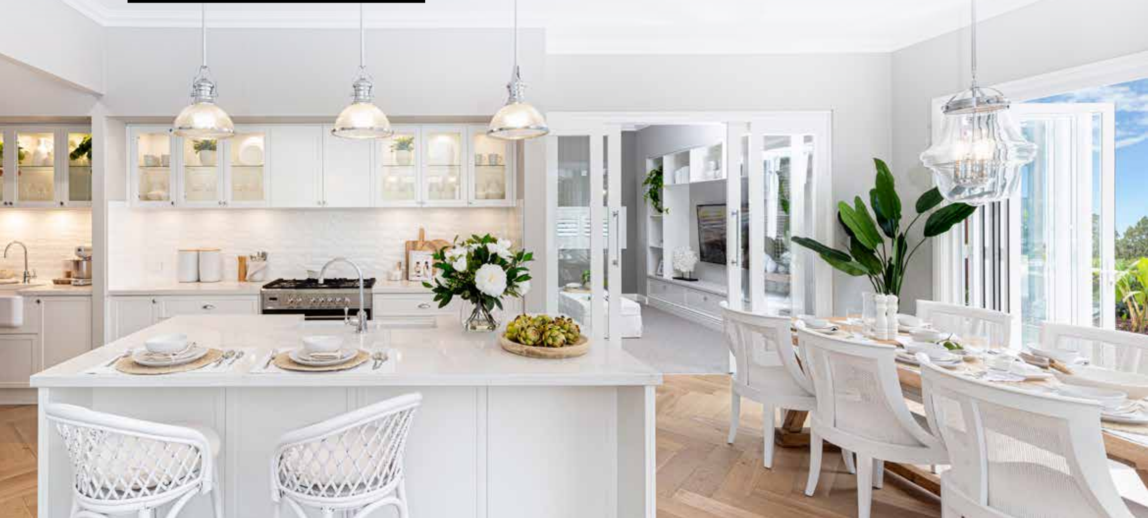
On display at Moonee Beach

Sensationally appointed with rich details and top-quality finishes that deliver a stunning home for generations to come.