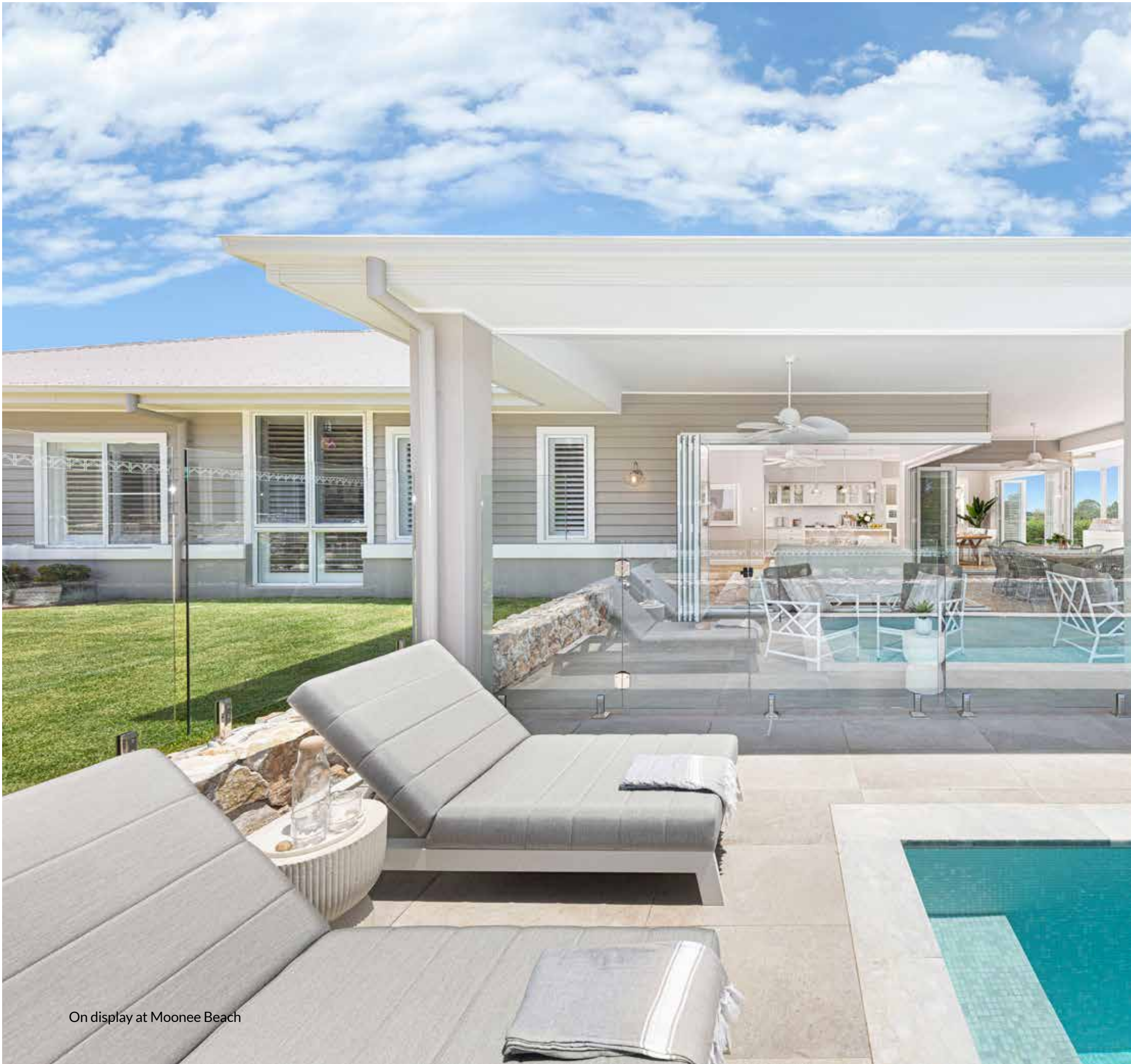
On display at Moonee Beach