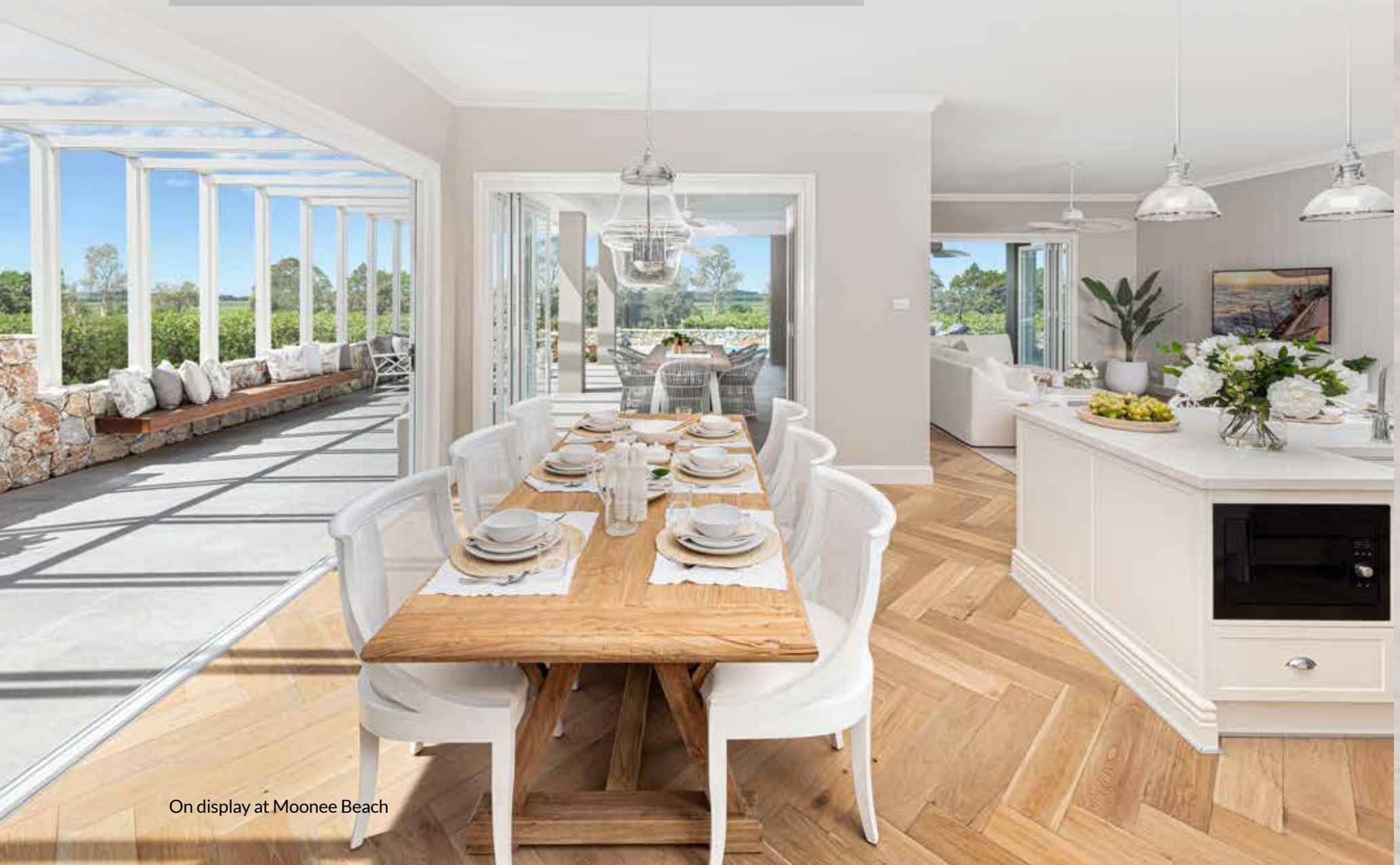
On display at Moonee Beach

OUR BUILDING AND DESIGN CONSULTANTS CAN TAKE YOU THROUGH ALL THESE OPTIONS AND MORE.