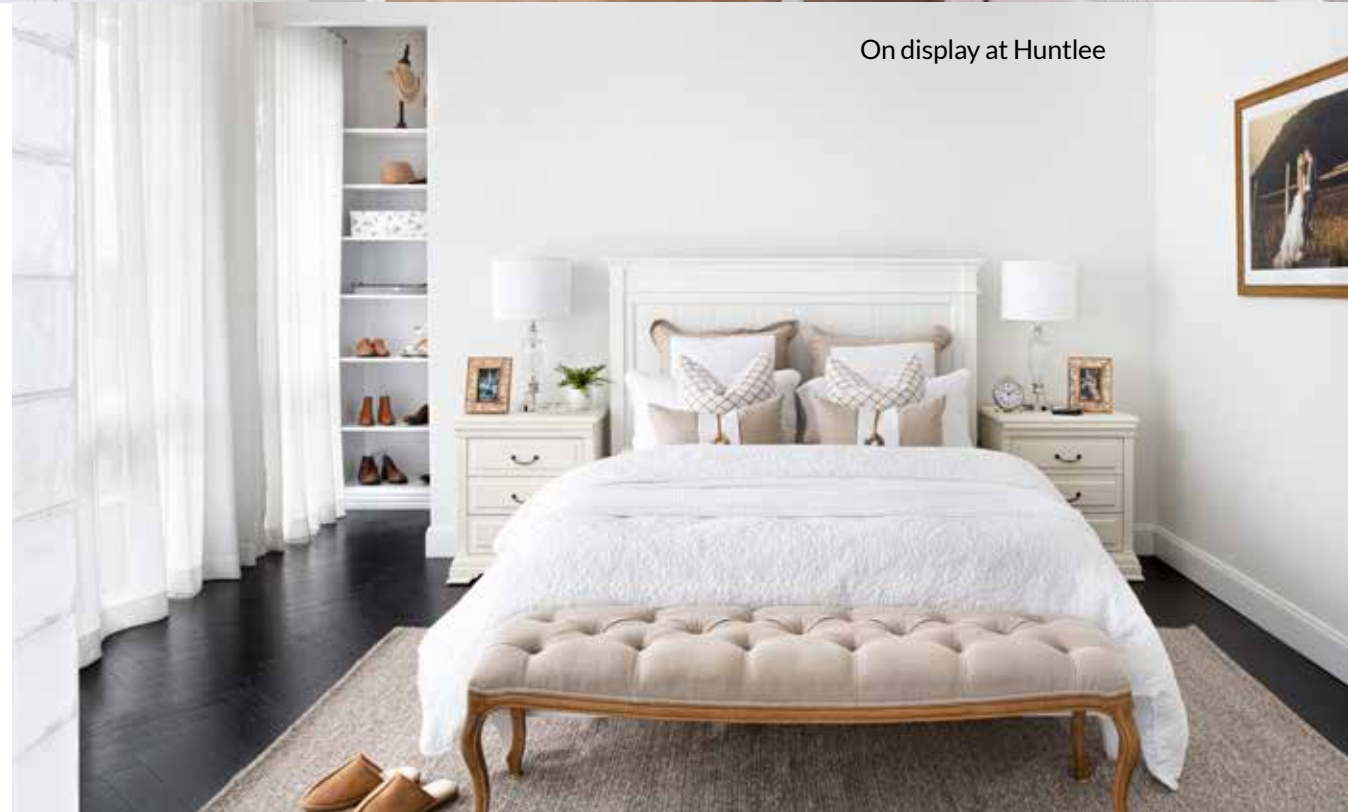
On display at Huntlee