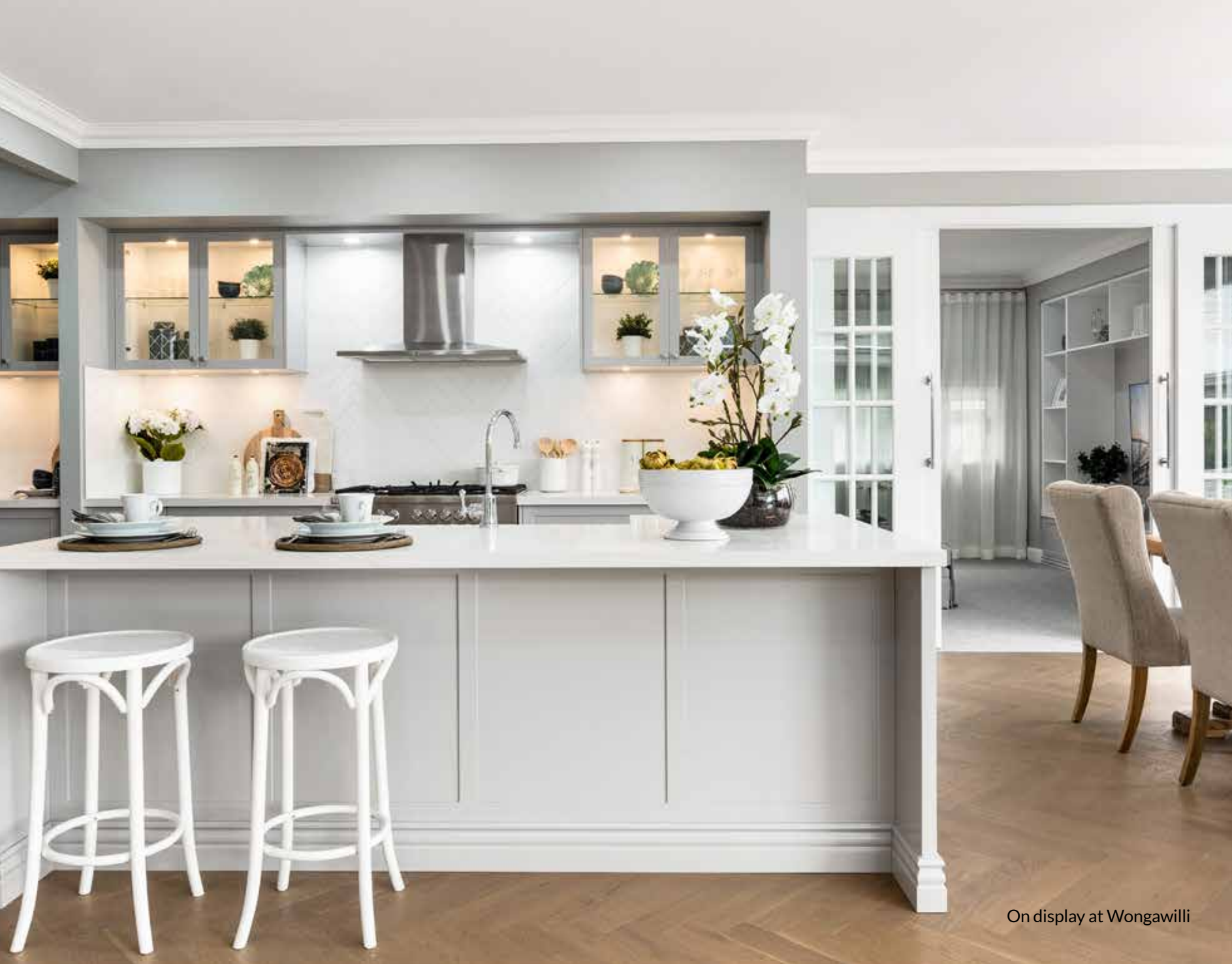
On display at Wongawilli