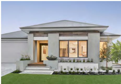
Applied render finish