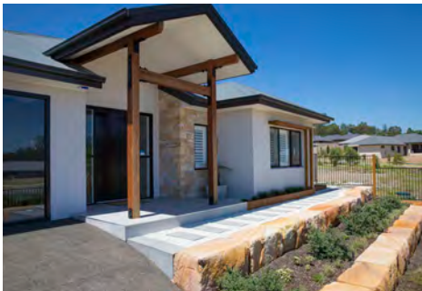
Good mix of materials