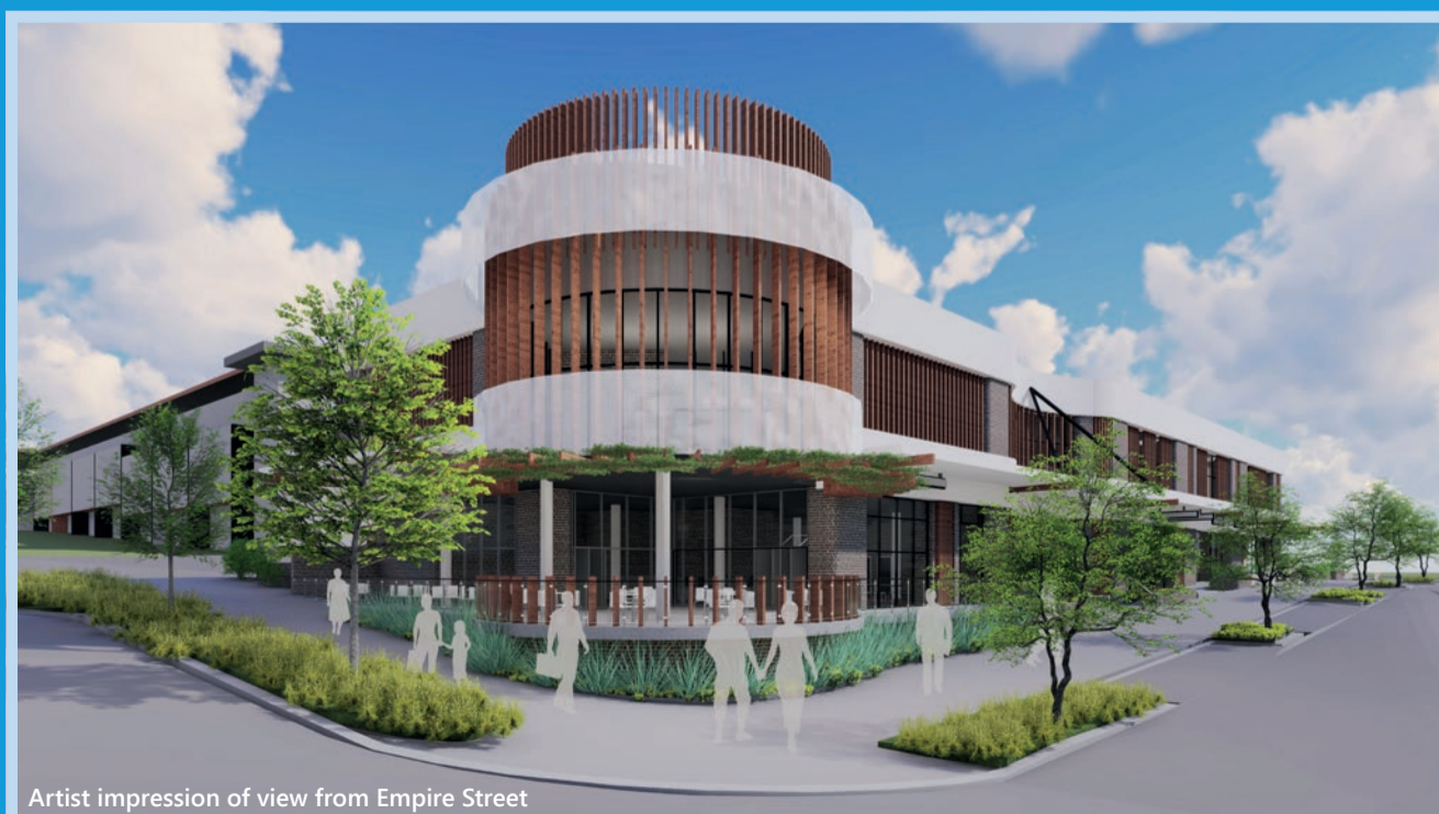
Artist impression of view from Empire Street

"A key location in the heart of the Town Centre is a logical destination for our head office."