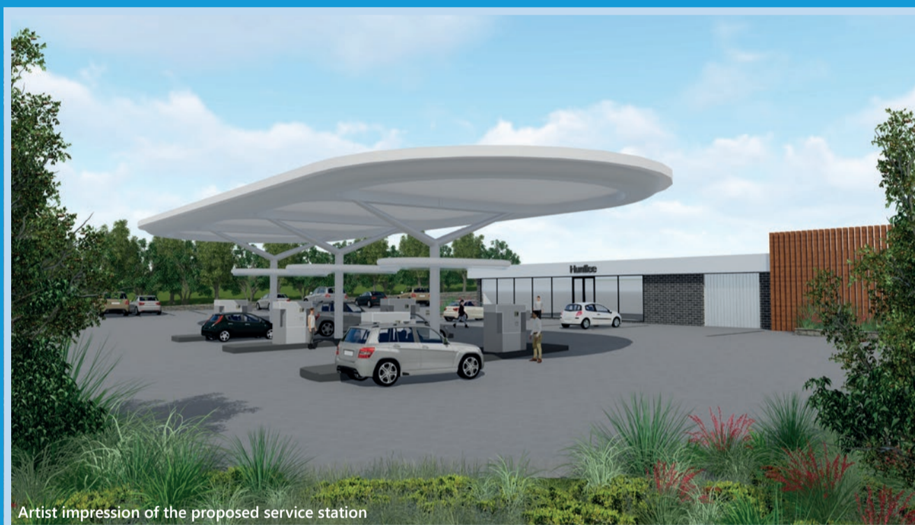
Artist impression of the proposed service station