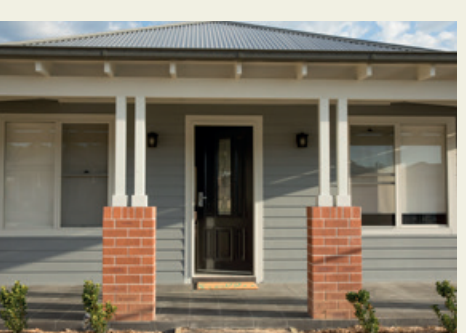
Face Brick is generally not permitted, however, where proposed in small quantities as a feature or detail, only traditional red brick will be permitted.