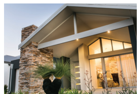
Good mix of materials