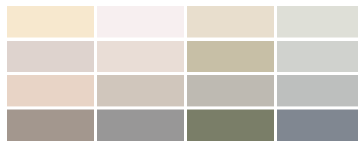
Colour palette for paint, render and trim.