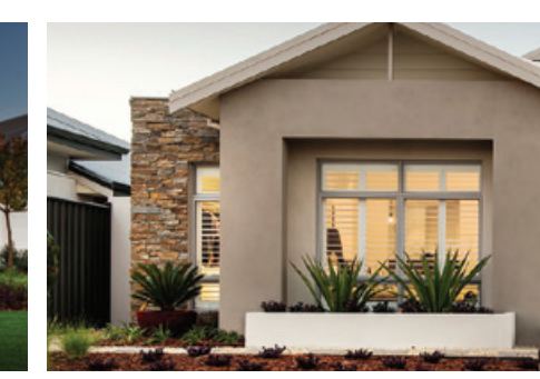
Applied Render Finish