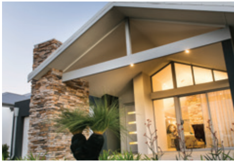
Good mix of materials