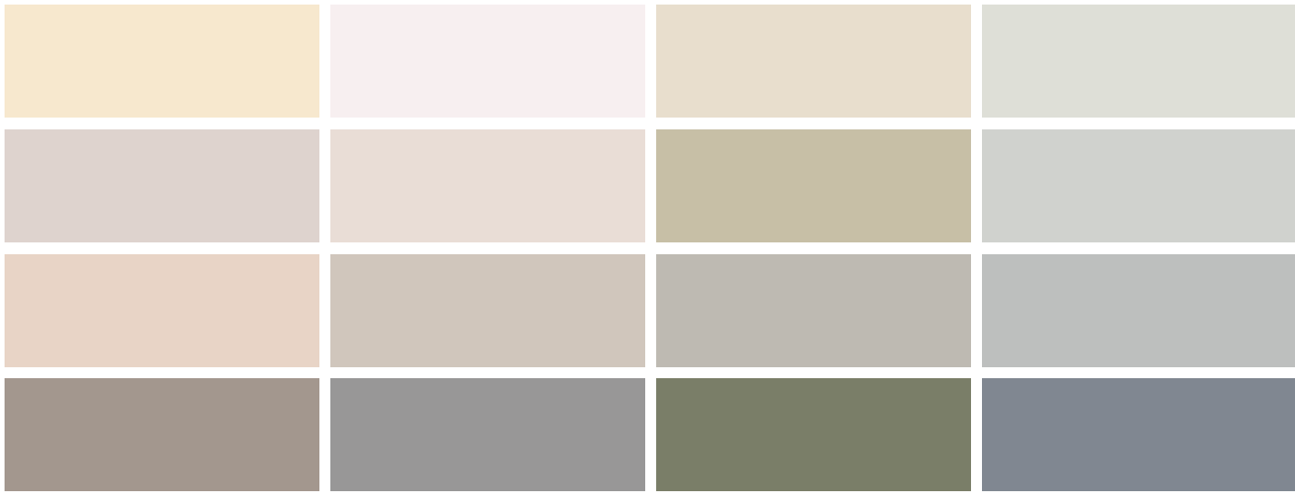
Colour palette for paint, render and trim.