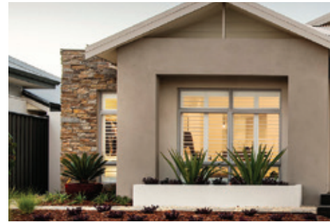
Applied Render Finish