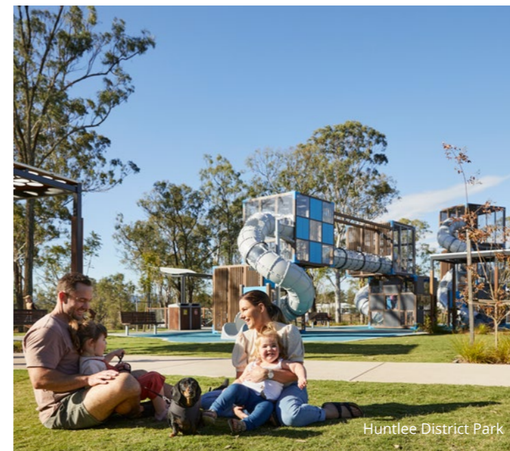
Huntlee District Park