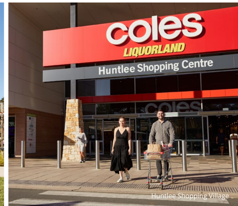
Huntlee Shopping Village