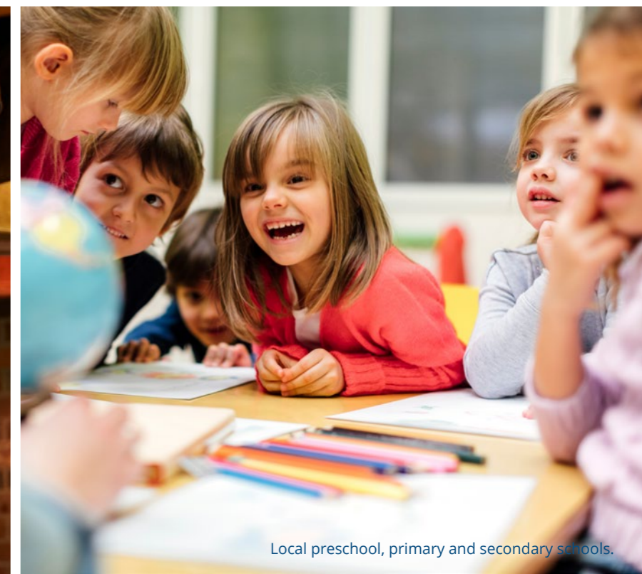
Local preschool, primary and secondary schools.

"I moved to Huntlee because of the community. Our kids play in the street like we did when we grew up and we've got lots of friends. It's a beautiful community."