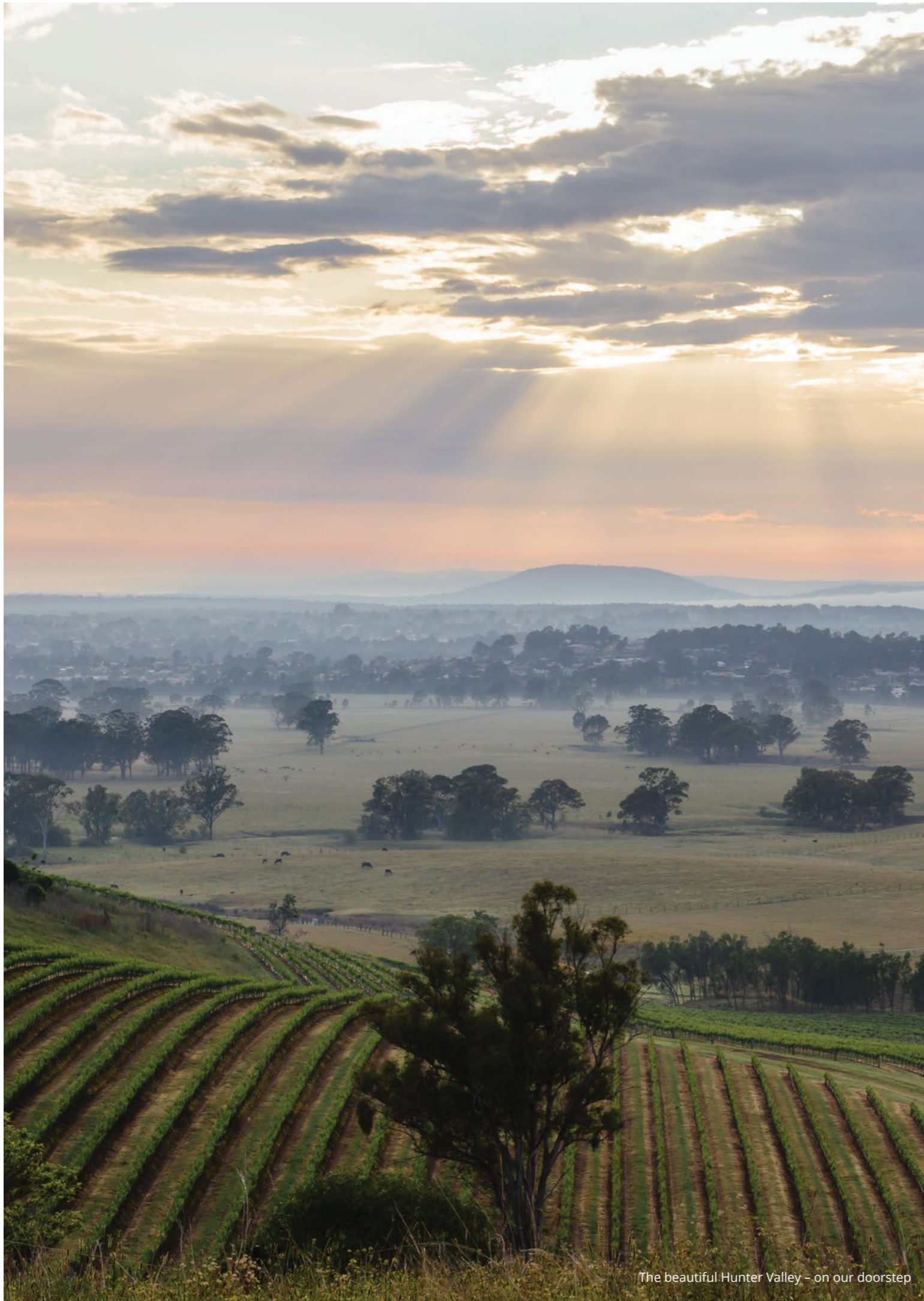
The beautiful Hunter Valley – on our doorstep