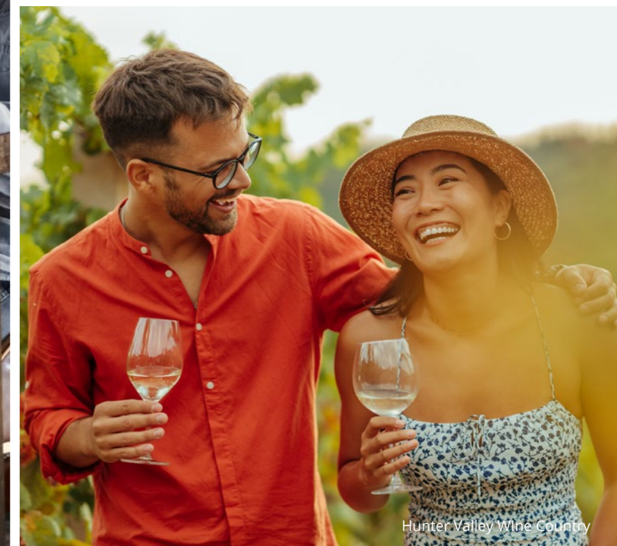
Hunter Valley Wine Country